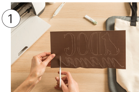
Remove cut design from mat and trim away unused area of sheet.