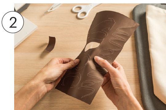
Gently roll cut design so cut lines separate and are more visible. "Cracking" the cut this way makes it easier to remove excess paper from in and around your design.