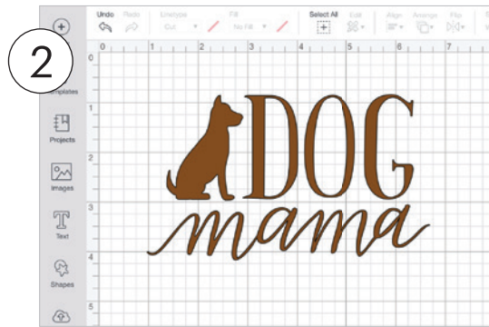
In Design Space, select and size your design to fit on tote blank.