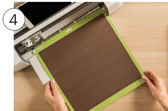
Load mat and blade into machine, then press flashing Go button.