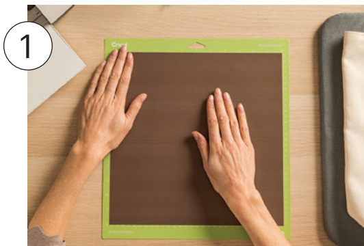
Place Infusible Ink Transfer Sheet onto StandardGrip Mat, liner side down.